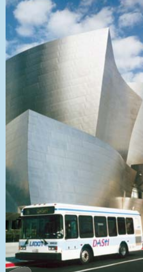
Walt Disney Concert Hall